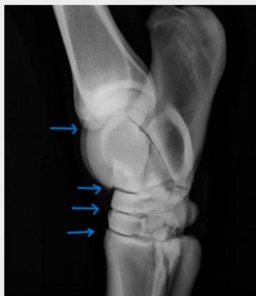
The arrows in this x ray point to the four joints in the hock. It is the bottom one (the TMT) that is injected into.

If you would like to discuss the options for your horse, please do give us a call for a chat or arrange an appointment for a visit and examination – 01837 214 004