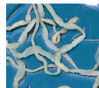
Tapeworms are long segmented worms which shed segments.

Tapeworms are long flat, segmented worms which live in the small intestines. They shed small mobile segments that pass out in the faeces and are often found around the tail areas of cats. As the segments break down they release eggs into the environment. These eggs may be eaten by intermediate hosts – these include fleas and small rodents such as mice and voles. As a result cats which are "mousers" will commonly have tapeworms. Similarly pets swallow fleas as they groom, and so re-infect themselves with tapeworms.