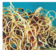
Roundworms are long, white and spaghetti like.

Roundworms are most commonly found in young animals but can infect adults as well. Many pups and kittens are born infected with roundworms because they cross the placenta and are also in the milk. They are spaghetti like in appearance and also live in the small intestines. They can cause weight loss, vomiting, diarrhoea and a pot belly in puppies and kittens. Adult roundworms shed eggs which are passed out in your pet's faeces and infect the environment. Pets can become re-infected by unwittingly eating the eggs, often whilst grooming. Additionally the eggs can pose a risk to humans if accidentally ingested.